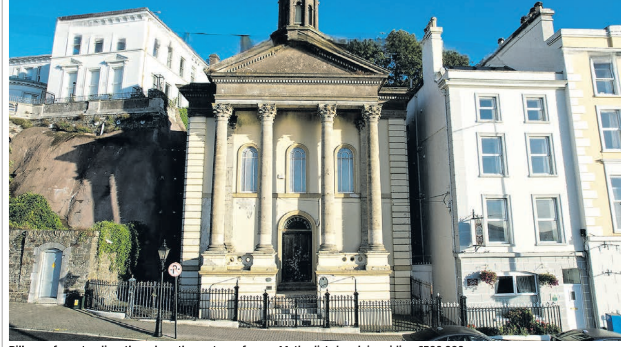
Pillars, a free-standing, three-bay, three-storey former Methodist church is guiding €500,000